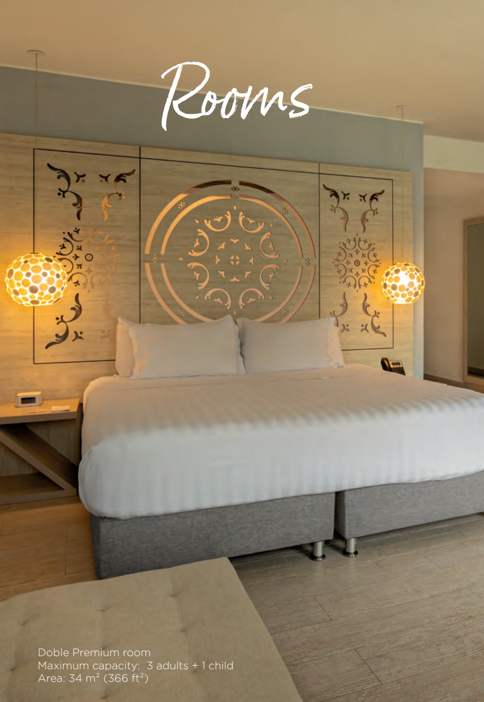
Doble Premium room Maximum capacity: 3 adults + 1 child Area: 34 m 2 (366 ft 2 )