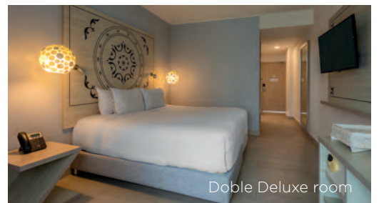
Doble Deluxe room

Maximum capacity: 2 adults + 1 child Area: 24 m 2 (258 ft 2 )